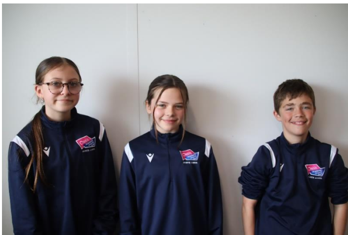
Our Sports Leaders