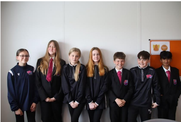
Our Student Parliament